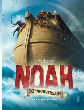
(2) Complimentary Ticket Vouchers