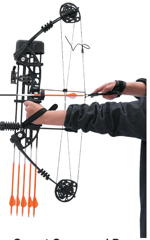
Cncest Compound Bow 35 - 60 lbs. Draw length 19-30"