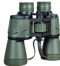
10x50 Travel Theater Binoculars with smartphone adapter.