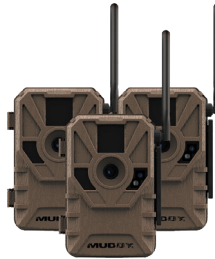
Muddy 2.0 Trail Cameras with cd cards, multi modes, Verizon and AT&T Networks.