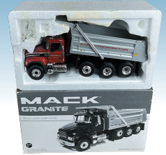
Rohrer's Tri-Axle Mack First Year Collectible