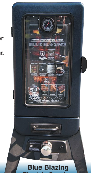
Blue Blazing Electric Smoker