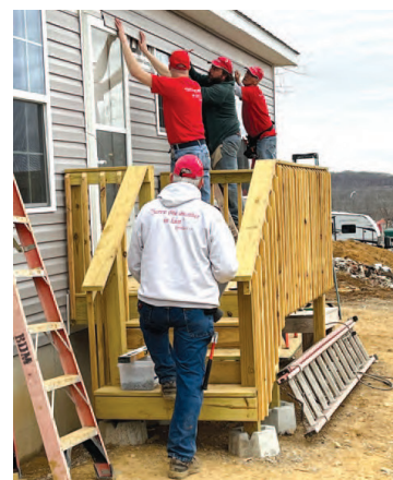
Kentucky

We invite you to support us at this event with donations of sale items, cash donations, as an attendee, or as a bidder. You are sure to find something of interest. Mark your calendar for September 26 and 27, 2025.